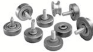
Flat Top Wheels